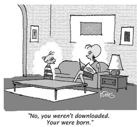
Figura 1. A typical figure

Figure and table captions should be centered if less than one line (Figure 1), otherwise justified and indented by 0.8cm on both margins, as shown in Figure 2. The caption font must be Helvetica, 10 point, boldface, with 6 points of space before and after each caption.