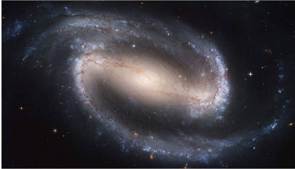
Figure 5: Barred spiral galaxy NGC 1300 photographed by Hubble telescope. While the galaxy in the photo is not our sun, it does emit light, much like our sun.